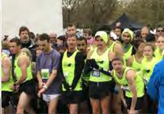
2017 Run or Walk for Southlake