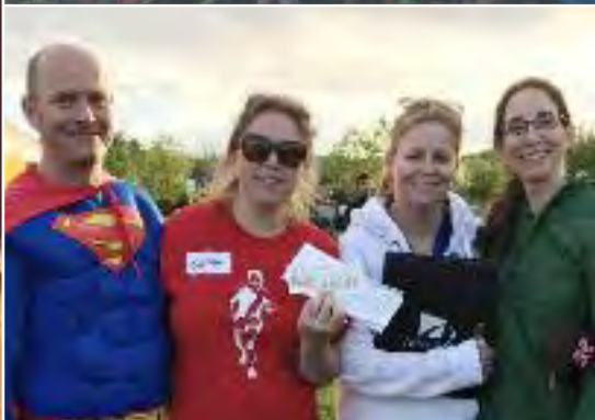
Terry Fox Public School Fun Fair