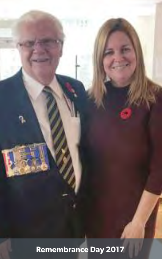
Remembrance Day 2017